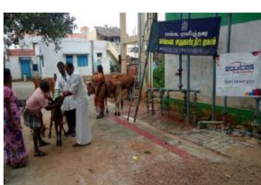
VETERINARY CAMP AT TRICHY