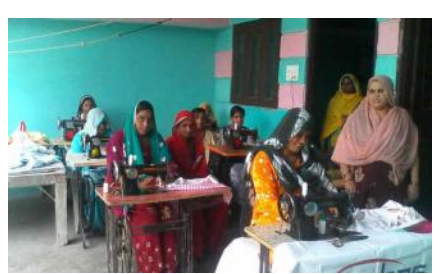
TAILORING TRAINING AT INDHORE