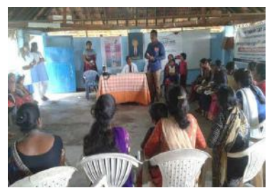
CANCER AWARENESS CAMP AT TIRUNELVELI