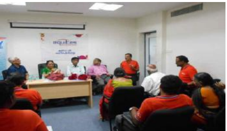
INTERNATIONAL DAY OF PERSONS WITH DISABILITY CELEBRATED AT HO