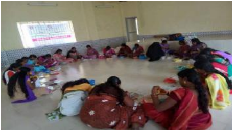
FASHION JEWELLERY MAKING TRAINING AT KOODAPAKKAM