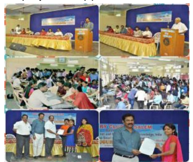
MEGA JOB FAIR AT SALEM

Equitas conducts job fair for the unemployed youth and has helped 2806 youth to get job offers in the month of Dec 2017. Cumulatively has helped 125362 youth to get employment opportunities so far.