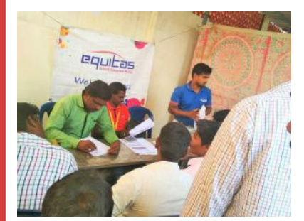
JOB FAIR AT MAYILADUTHURAI