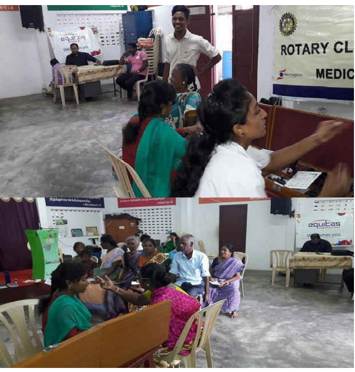
EYE CAMP CONDUCTED AT VYASARPADI