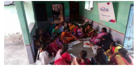
BLOUSE CUTTING TRAINING AT TRICHY

2109 members located across India benefitted through five day skill training like Tailoring, Fashion Jwellery making, Masala making....etc. These training facilitates members to earn additional income. Along with the skill trainings, these women were provided health education, developed and supported by "Freedom from Hunger", USA. Through this health education women are being taught the importance of prevention from non communicable diseases.