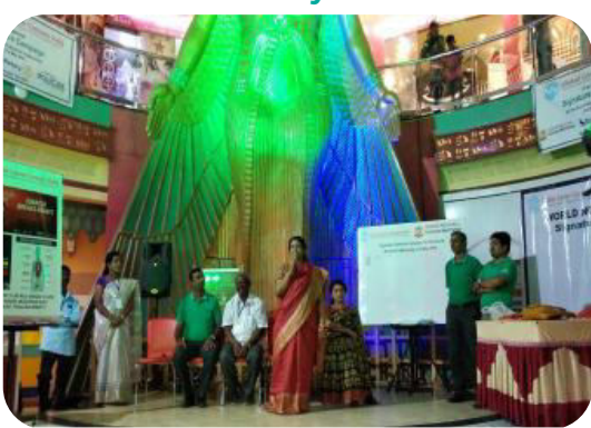
"World No Tobacco Day" was observed with a signature Campaign, and totally 127 participants have signed in the campaign held at Abirami mega mall, Puraisaiwalkam, chennai