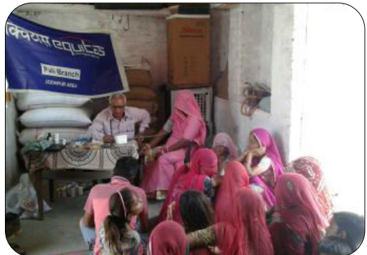
Health camp at Pali, Jodhpur area