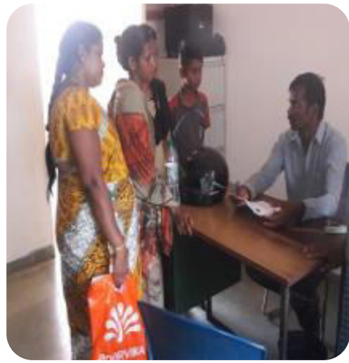
Two of our EBN Member's children were helped to get admission in hostel Rotary Boys. Town, Supported by Rotary Club of Madras.