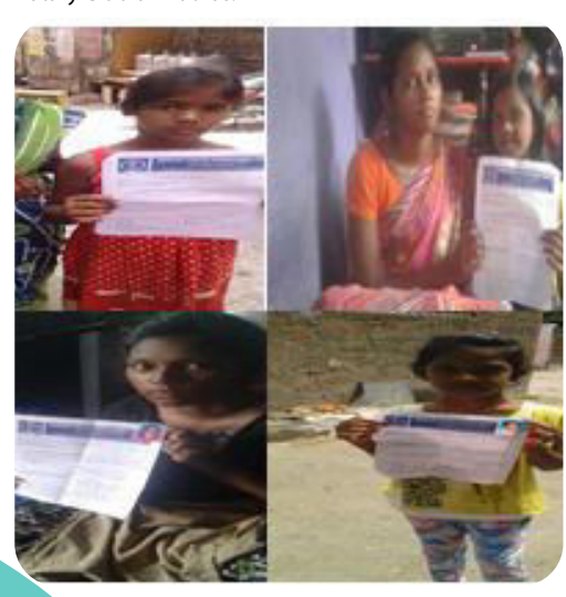
10 EBN Member's children were given scholarship that was sponsored by Indian Youth charitabe Trust.