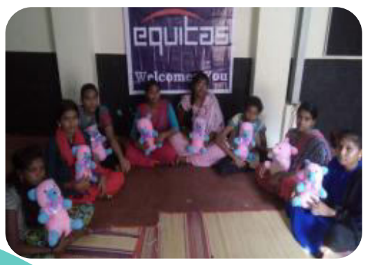
Doll making training at Chintaripet

Equitas strives for the enhancement of quality of women's lives by providing skill trainings and empowering them to earn supplemental income. This also gives economic independence to women and ensures their participation in the economic development of our nation.