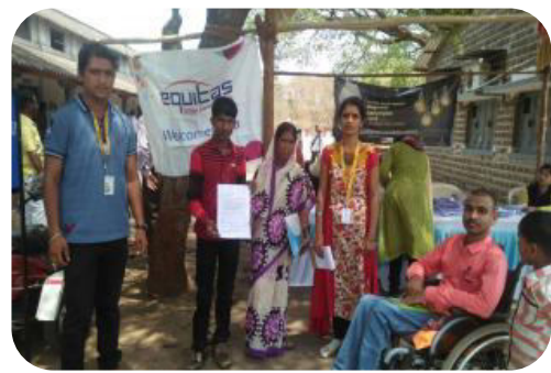
Jobfair for differently abled at Pune, Maharastra