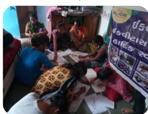
Beautician training at Bapunagar, Ahmedabad