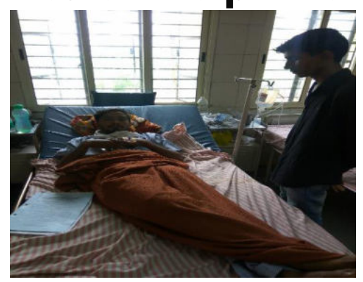
OUR MEMBER'S SON IN AURANGABAD WAS ASSISTED FOR HERNIA OPERATION AND HELPED HER TO SAVE