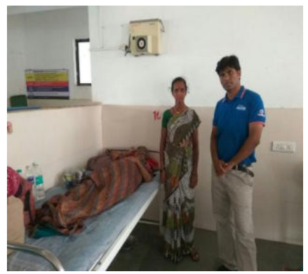
ASSISTED FOR A KNEE OPERATION FOR OUR MEMBER'S MOTHER IN LAW IN NASHIK AND HELPED HER TO SAVE RS. 45000