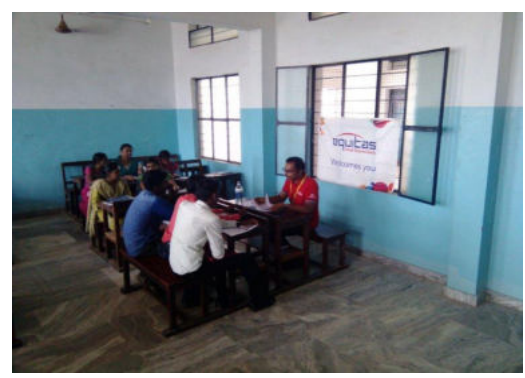
JOB FAIR AT TIRUNELVELI