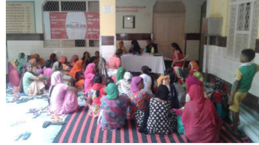
DENTAL SCREENING CAMP AT HISAR

83674 Members benefitted through medical camps conducted across India by partnering with various hospitals. 31454 Members were screened in eye camps. 117 persons underwent free cataract eye operations and 1161 nos. of free spectacles distributed.