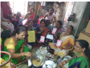
ATTEND TRAINING FOR MASALA MAKING

3164 members located across India benefitted through five day skill training for making products like Masala Powder Making, Candles making, Washing powder Making....etc. These trainings supports member's to earn additional income. Along with the skill trainings these women were provided health education, developed and supported by "Freedom from Hunger", USA. Through this health education women are taught importance of preventing non communicable diseases.