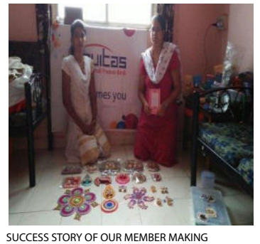
FANCY CANDLES FOR DIWALI