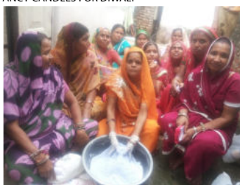
MEMBERS FROM JAIPUR BRANCH ATTEND TRAINING FOR WASHING POWDER